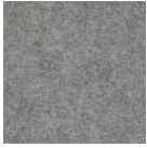
03 - Light Gray